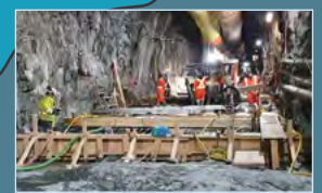
7 Commencement of construction of the Horetzky Plug