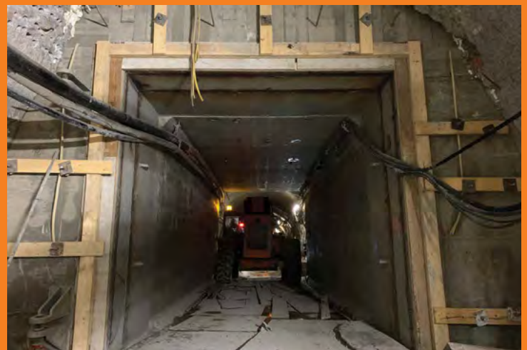
2600 Plug and the commencement of construction of the Horetzky Plug.

Landing. This plug will be 12m long and horseshoe shaped 7m wide and 7m tall. Both plugs are made of concrete and will have a 3m by 3m steel door that will allow equipment access for future maintenance. The plugs include drainpipes that can be opened by valves to empty the tunnel when and if access is required at a later date. It takes six to eight weeks to construct a plug!