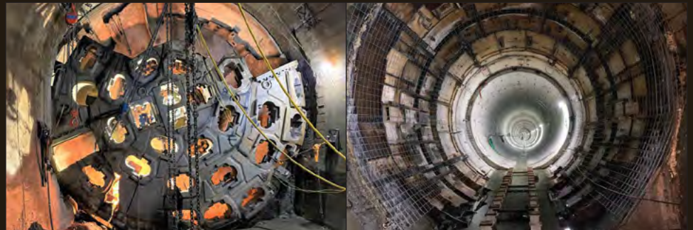
Removal of the cutter head of the TBM, TBM Shield will be incorporated into tunnel lining.

When all the services are removed, workers will finish cleaning the tunnel and perform a final inspection before filling the tunnel with water in the summer of 2022.